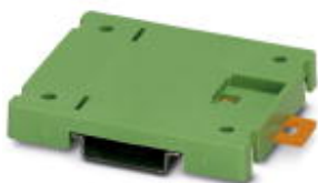
The figure shows version EM-MP 45 N

Mounting plate, for screwing on siz 0 switchgear