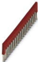
Plug-in bridge, pitch: 6.2 mm, width: 122.3 mm, number of positions: 20, color: red

Please be informed that the data shown in this PDF Document is generated from our Online Catalog. Please find the complete data in the user's documentation. Our General Terms of Use for Downloads are valid ( http://phoenixcontact.com/download )